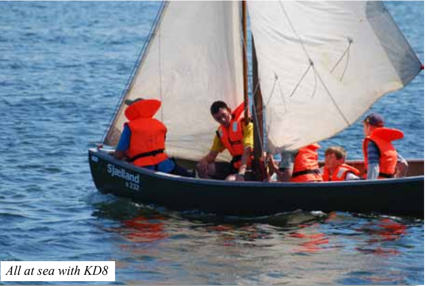
Twin Town News November 2012

On Friday 20 July, an early start at 1.30 am. from our scout hut in Habberley Road was the beginning of our much-anticipated trip to the Danish Scout and Guide Jamboree at Holstebro in Jutland, Denmark. Months of planning with Stjerne Gruppe , our friendship scout group from Husum, had seen our kit van leave Kidderminster two days earlier. Now the main party of 27 were off to Stansted for an early flight to Billund in Denmark.