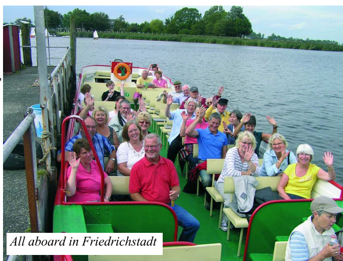
All aboard in Friedrichstadt