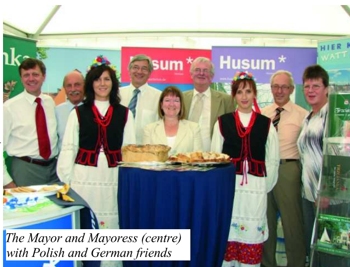
The Mayor and Mayoress (centre) with Polish and German friends

So much was packed into the five days' stay that I cannot go into much detail here. However it includ-