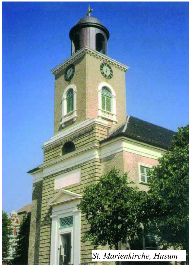
St. Marienkirche, Husum