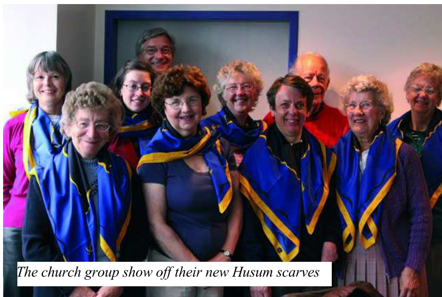
The church group show off their new Husum scarves

German is non-existent!) and we got on famously. She introduced me to the shops, the harbour, the Castle and the park, and we worshipped at her Roman Catholic church. Highlights of the visit for me were the meal and discussion at the Friedenskirche , the visit to the dyke, where we had a superb meal in the restaurant, the performance of "The Creation" at St. Marienkirche , the fare-