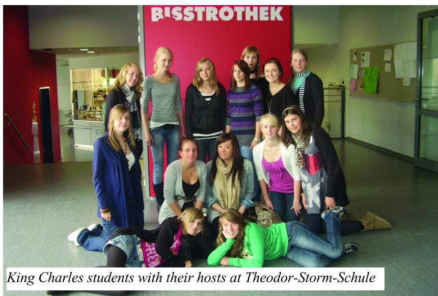
King Charles students with their hosts at Theodor-Storm-Schule

At the end of September seven students from King Charles I School in Kidderminster made the trip to Husum, to spend a few days with host families and to experience life at the Theodor-Storm-Schule. They took part in a variety of activities, including a ferry trip to one of the Halligen , and we understand that they greatly enjoyed the experience. We are hoping that a fuller account of their visit will be available for the next edition of the Newsletter, and in the meantime we have some pictures of the visit.