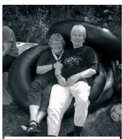
It's hard work looking after Cub Scouts!

Friday was an early start with over 30 coaches departing the Safari Park at 6.00 am to take everyone on a day trip to the World Scout Jamboree at Hylands Park in Essex. The size of the camp and the huge range of nationalities represented was mind boggling!! Fields full of tents gave some idea of the