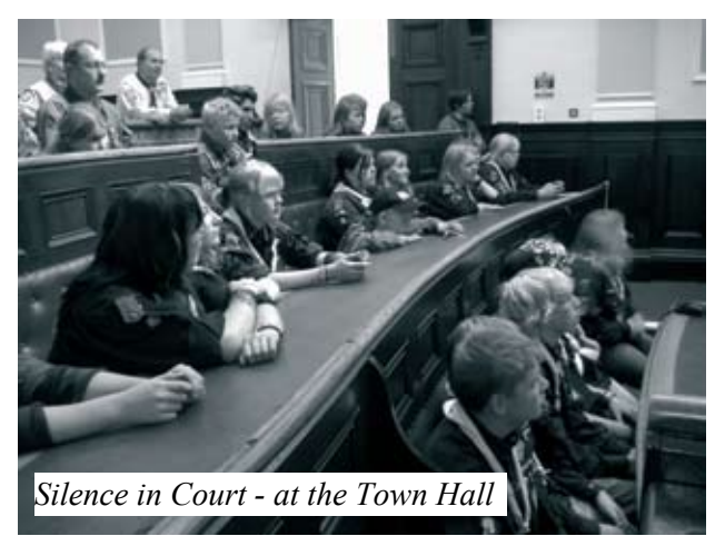
July, so we were very lucky, when, after a long bus ride from Husum across the Channel we saw the sun

had heard a lot about the heavy rain in England in