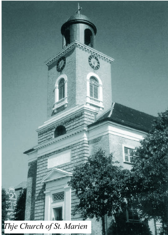
The Church of St. Marien

At the end of September a small group will travel via Birmingham and Hamburg to Husum for a weekend hosted by the churches of Husum. They