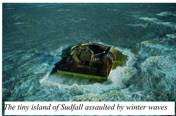
The tiny island of Sudfall assaulted by winter waves

We have received information that the application to UNESCO for the Wattenmeer (the seas and islands of Nordfriesland) to be recognised as a World Heritage Site was approved on June 26! This recognition of the uniqueness of the Watten-