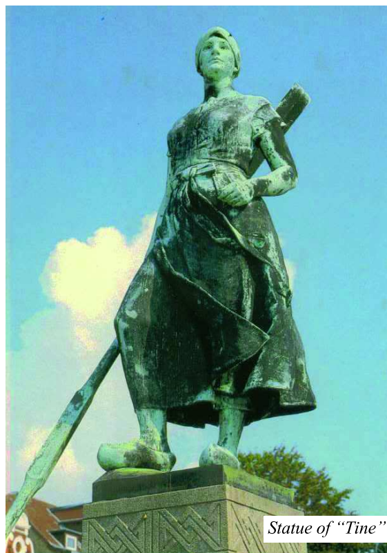
Statue of "Tine"

Husum is the centre point of life in North Friesland. One comes to Husum in order to shop and stroll.