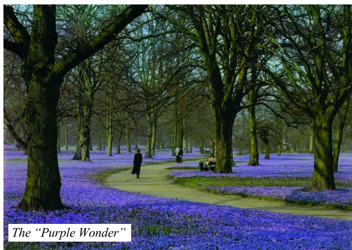
The "Purple Wonder"

Husum is colourful. Early in the Spring, the cosy harbour city provides visitors with a colourful image. The "Purple Wonder of the North" – the blossoms of more than four million violet crocuses in the Husum Castle Park – is celebrated every year with the crowning of the Crocus Blossom Queen at the Krokusblütenfest (Crocus Blossom Festival). A unique nature play which you abso-