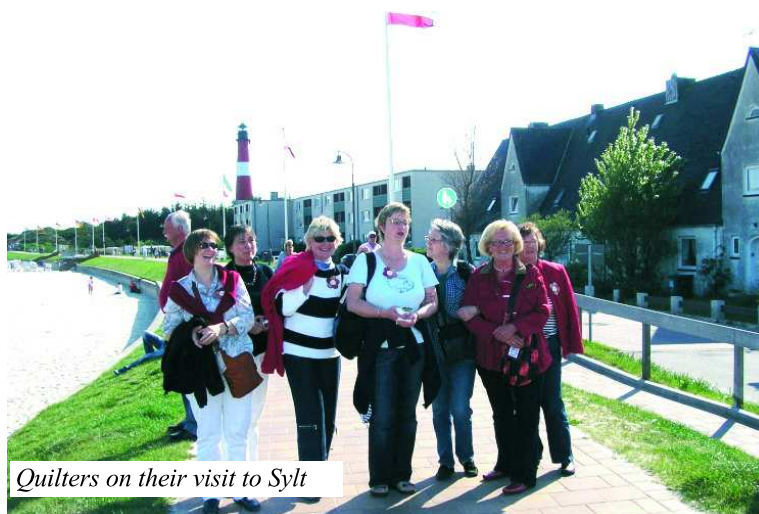
Quilters on their visit to Sylt

Salt in the air and always a fresh breeze from the North Sea. That's Husum. And this unending view of the North Sea. Did you know that In Husum's city district of Schobüll, you will find the only dyke-free section of the North Sea coast of Schleswig-Holstein? It gives a magnificent view of Husum Bay – just the place to unleash your soul. And the place, too, for new ideas and business because, under the wide skies of North Friesland, there is time and space for creativity.