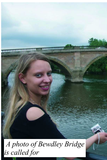
A photo of Bewdley Bridge is called for