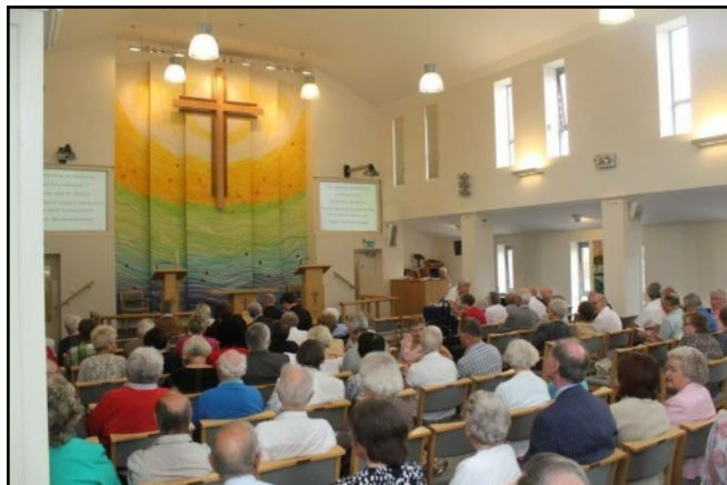
The service at Trinity Methodist Church