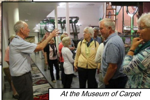
At the Museum of Carpet