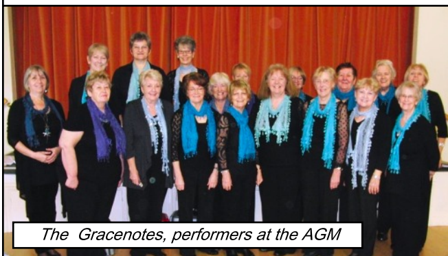
The Gracenotes, performers at the AGM

The Committee met again in November, and received progress reports on the various planned visits and activities. Arrangements for the AGM in March 2016 were noted.