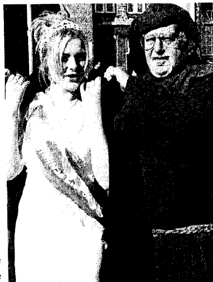
A monk assists the Crocus Queen

Back in the 15 th century, where the Husum Castle now stands, there was a monastery, and the Castle Park was the monastery garden. The monks needed a source for the colouring of their