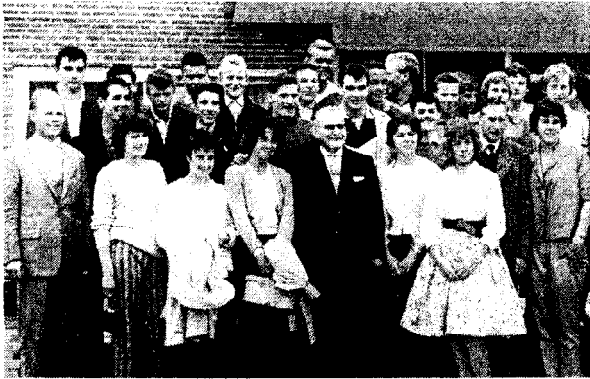
The Youth Group of 1960

It was then agreed to exchange Youth Groups as the best way of carrying the connection forward and the first group from the Worcester Cross Youth Club went to Husum in the summer of 1960. Having been elected a Councillor in 1959,