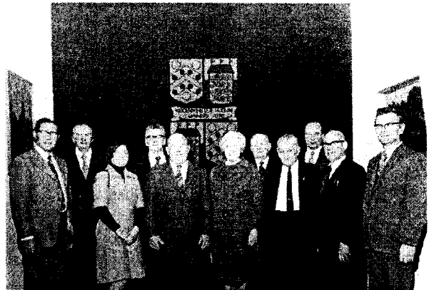
The presentation of a carpet produced by Brintons for the signing of the Twinning Charter in Husum in 1977