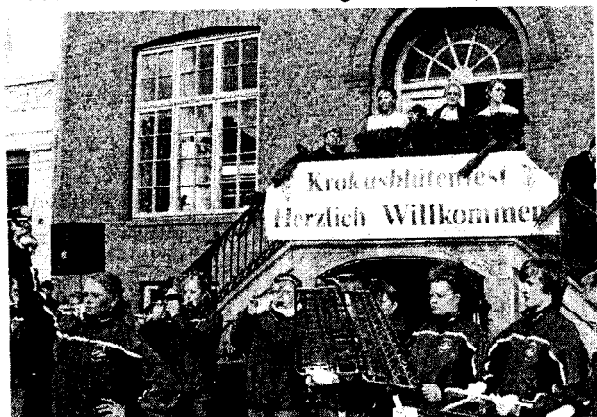
The opening ceremony of the crocus festival

Husum is well known throughout Europe for the