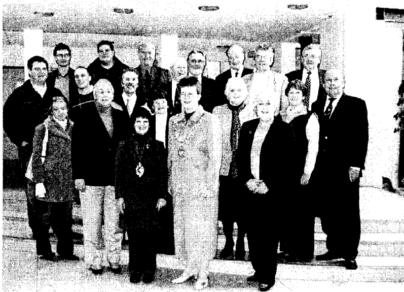
The Civic welcome at the new Town Hall