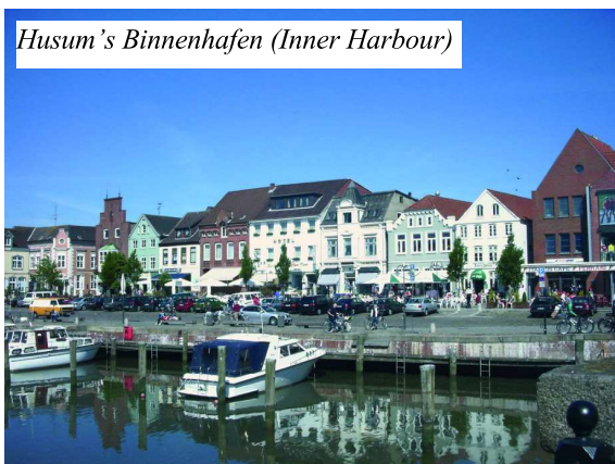
Husum's Binnenhafen (Inner Harbour)

Those who know Husum will recall the two lines of sturdy posts set in the harbour bed on either side of the Binnenhafen . These served mainly to mark