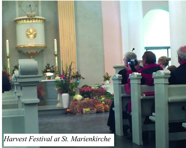
Harvest Festival at St. Marienkirche