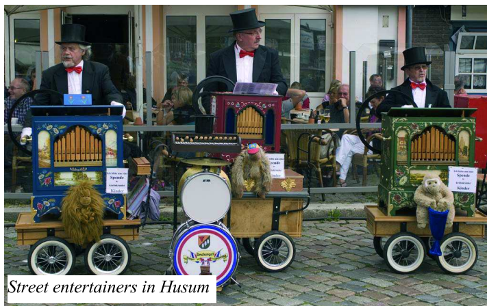
Street entertainers in Husum

The harbour area was bustling with people visiting the various stalls and watching street entertainment (see photo). We enjoyed lunch at a harbour-