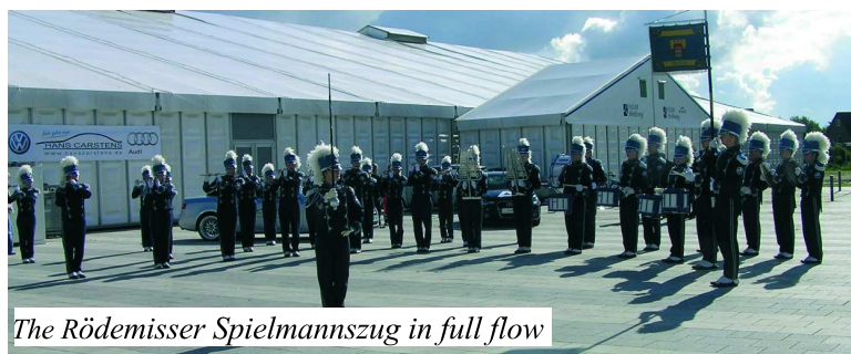
The Rödemişer Spielmannszug in full flow