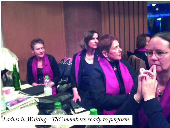
Ladies in Waiting - TSC members ready to perform

Monday was a more leisurely day of shopping and visits, before my return home on Tuesday. Another hectic, but very exciting, enjoyable and worthwhile visit to our twin town.