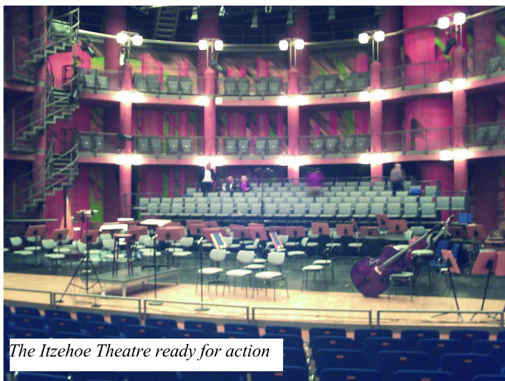
The Itzehoe Theatre ready for action

Sunday morning saw us attending the Erntedankfest (Harvest Festival) in St. Marienkirche before setting out at noon for another rehearsal and concert, this time in Husum’s brand-new Congress-Centrum. This multipurpose hall is very well suited for choral and orchestral performance, with a good acoustic and state-of-the-art lighting and sound facilities, and the adjoining seminar rooms provide ample off-stage accommodation.